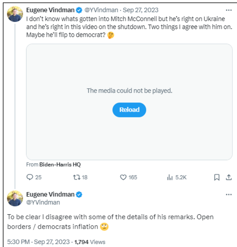
(Eugene Vindman, Twitter , 9/27/23)

In A September 23, 2023 Tweet, Vindman Appears To Respond To Mitch McConnell Speech And Said He Disagreed With The Senator That America’s Southern Border Is Open. “I don’t know what’s gotten into Mitch McConnell but he’s right on Ukraine and he’s right in this video on the shutdown. Two things I agree with him on. Maybe he’ll flip to democrat? To be clear I disagree with some of the details of his remarks. Open borders / democrats inflation” (Eugene Vindman, Twitter , 9/27/23)