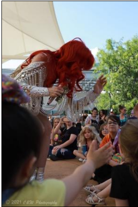
( Clock Inc. , Accessed: 4/23/24)