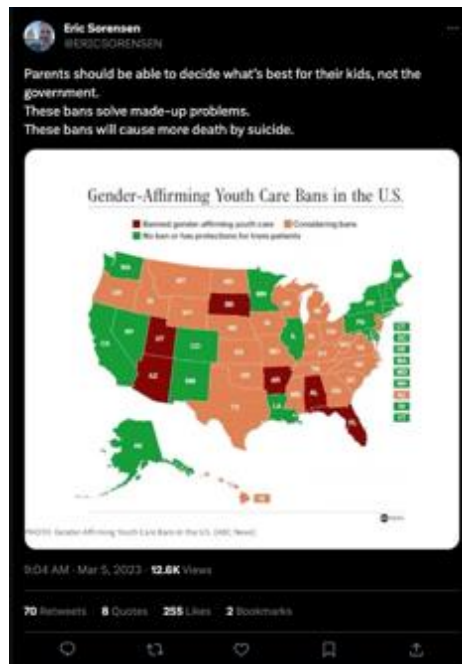
(Eric Sorensen, Twitter , 3/5/23)

In March 2023, Eric Sorensen Opposed Bans On “Gender Affirming Care,” Claiming The Bans Solve “Made-Up Problems” And Will “Cause More Death By Suicide.” “Parents should be able to decide what’s best for their kids, not the government. These bans solve made-up problems. These bans will cause more death by suicide.” (Eric Sorensen, Twitter , 3/5/23)