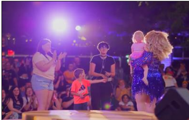
(The Project Of The Quad Cities, Facebook , 6/7/21) Minute: 0:02

VIDEO: On June 7, 2021, The Project Of The Quad Cities Appeared To Post A Recap Video From The Events. (The Project Of The Quad Cities, Facebook , 6/7/21)