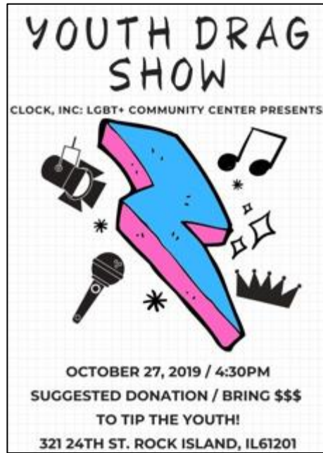
(Clock, Inc LGBT+ Community Center, Facebook , 10/26/19)