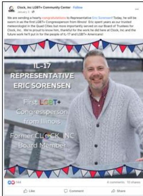
(Clock Inc LGBT+ Community Center, Facebook , 1/3/23)