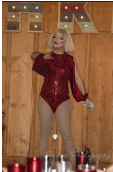
(Clock, Inc LGBT+ Community Center, Facebook , 2/15/19)