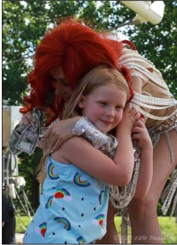
( Clock Inc. , Accessed: 4/23/24)