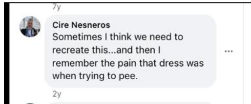
(Marsha Chosnyk, Facebook , 9/21/14)