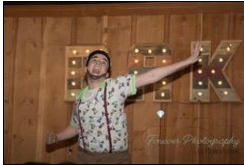
(Clock, Inc LGBT+ Community Center, Facebook , 2/15/19)