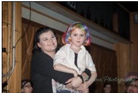
(Clock, Inc LGBT+ Community Center, Facebook , 2/15/19)