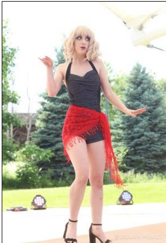
( Clock Inc. , Accessed: 4/23/24)