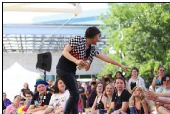
( Clock Inc. , Accessed: 4/23/24)