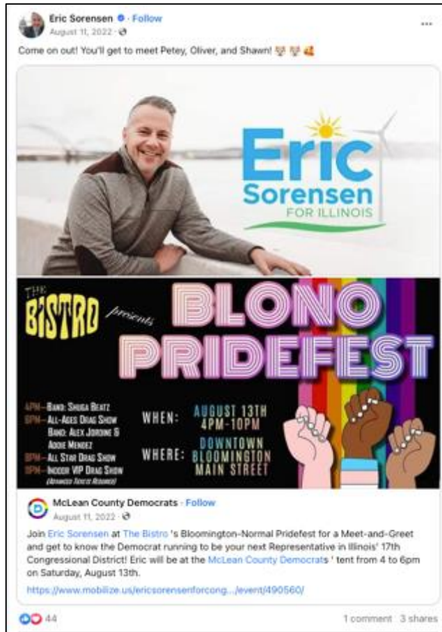
(Eric Sorensen, Facebook , 8/11/22)