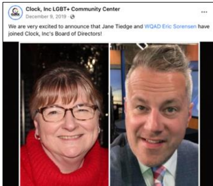
(Clock, Inc. LGBT+ Community Center, Facebook , 12/9/19)