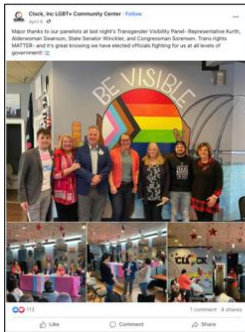
(Clock Inc LGBT+ Community Center, Facebook , 4/8/23)