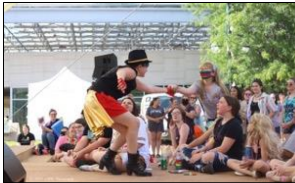
( Clock Inc. , Accessed: 4/23/24)

( Clock Inc. , Accessed: 4/23/24; Clock Inc. , Accessed: 4/23/24; Clock Inc. , Accessed: 4/23/24; Clock Inc. , Accessed: 4/23/24; Clock Inc. , Accessed: 4/23/24; Clock Inc. , Accessed: 4/23/24)