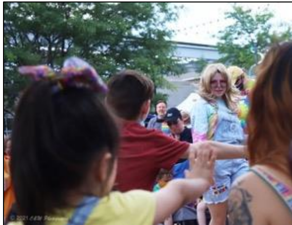
( Clock Inc. , Accessed: 4/23/24)