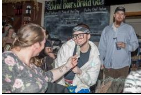
(Clock, Inc LGBT+ Community Center, Facebook , 2/15/19)

PHOTOS: The Event Included Drag Queens And Drag Kings. (Clock, Inc LGBT+ Community Center, Facebook , 2/15/19; Clock, Inc LGBT+ Community Center, Facebook , 2/15/19; Clock, Inc LGBT+ Community Center, Facebook , 2/15/19; Clock, Inc LGBT+ Community Center, Facebook , 2/15/19)