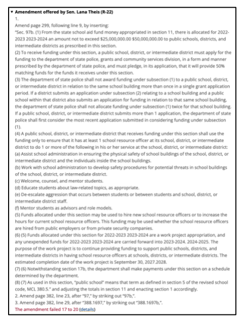
("2023 Senate Bill 173 / Public Act 103," Michigan Votes, Accessed: 1/17/24)

service at the school, district, or intermediate district" ("2023 Senate Bill 173 / Public Act 103," <u>Michigan Votes</u>, Accessed: 1/17/24)