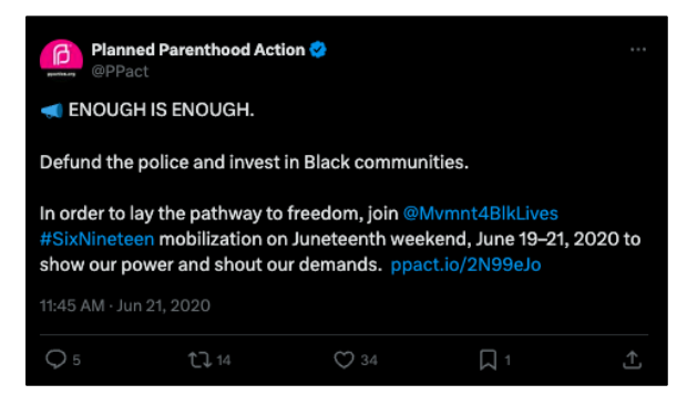
(Planned Parenthood Action, Twitter, 6/21/20)

In June 2020, Planned Parenthood Action Fund Called For Defunding The Police And Investing In Black Communities. (Planned Parenthood Action, <u>Twitter</u>, 6/21/20)