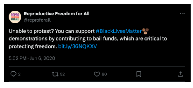
(Reproductive Freedom For All, Twitter, 6/6/20)

In June 2020, Reproductive Freedom For All Encouraged Their Followers To Contribute To Bail Funds In Support Of Demonstrators. "Unable to protest? You can support #BlackLivesMatter demonstrations by contributing to bail funds, which are critical to protecting freedom." (Reproductive Freedom For All, Twitter, 6/6/20)