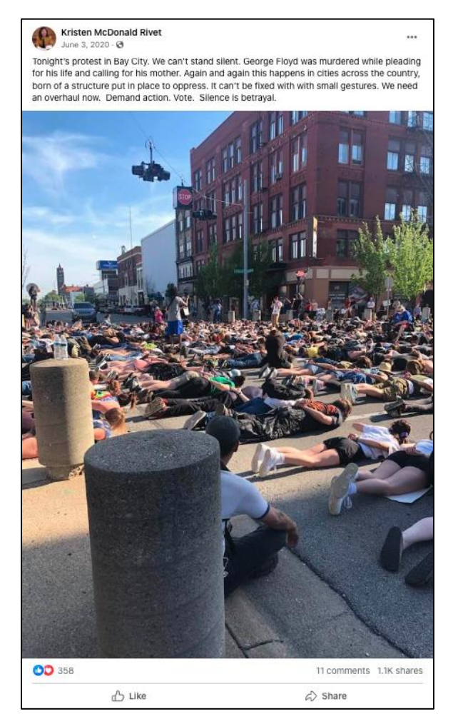
(Kristen McDonald Rivet, Facebook, 6/3/20)