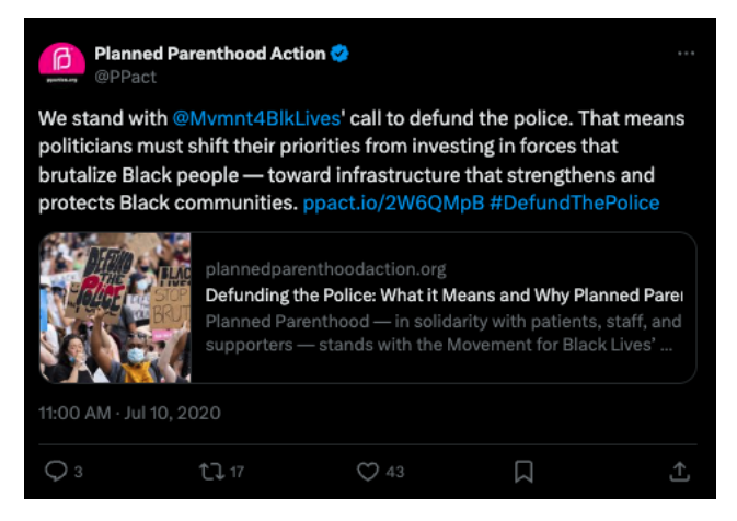
(Planned Parenthood Action, Twitter, 7/10/20)

Planned Parenthood Federation Of America Called For Defunding The Police. (Planned Parenthood, <u>Twitter</u>, 6/21/20)