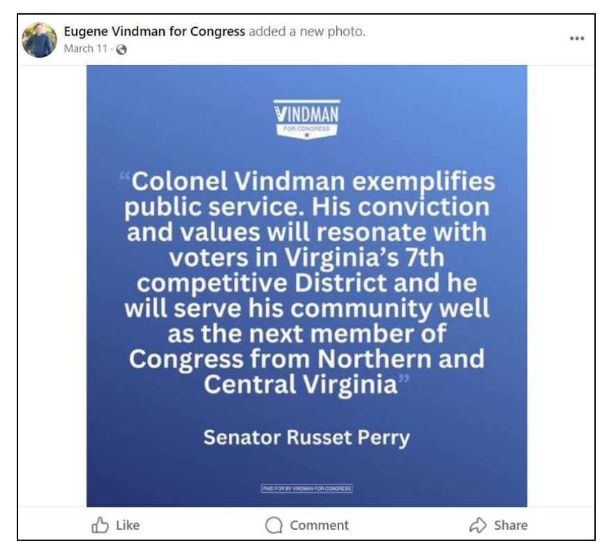
(Eugene Vindman For Congress, Facebook, 3/11/24)