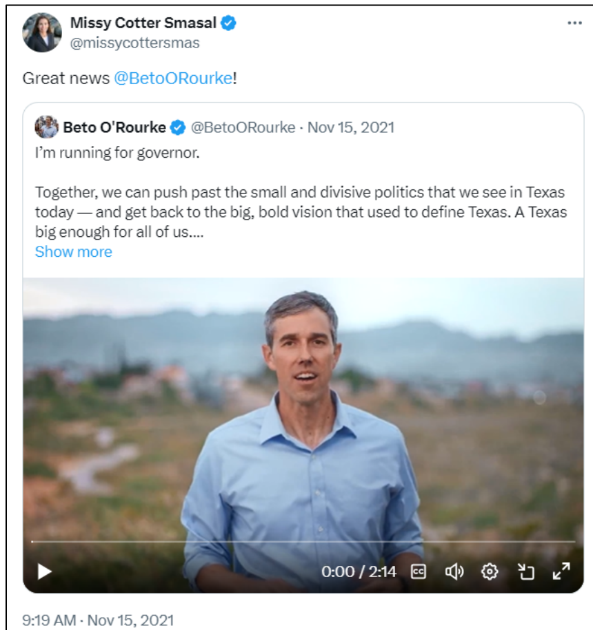
(Missy Cotter Smasal, Twitter , 11/15/21)