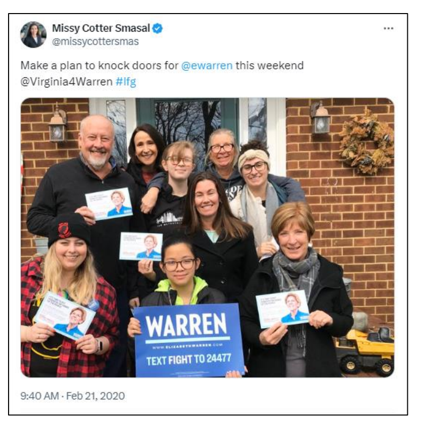
(Missy Cotter Smasal, Twitter, 2/21/20)