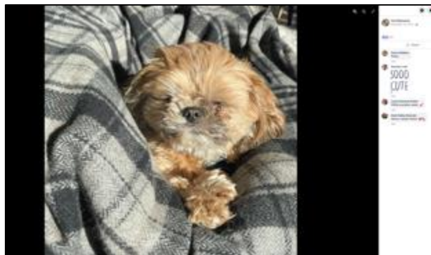
(Cire Nesneros, Facebook , 12/13/22)

In December 2022, The Cire Nesneros Account Changed Its Profile Picture To A Dog That Appears To Be Named Petey. (Cire Nesneros, Facebook , 12/13/22)