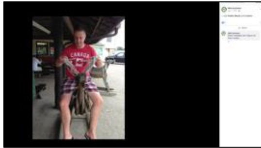
(Mike Sorensen, Facebook , 7/7/13)