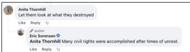
(Eric Sorensen, Facebook , 6/28/20)

Responding To A Comment On The Post That Highlighted The Destruction, Sorensen Claimed, “Many Civil Rights Were Accomplished After Times Of Unrest.” (Eric Sorensen, Facebook , 6/28/20)