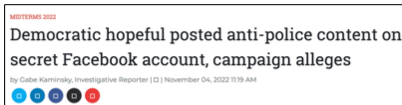
(Gabe Kaminsky, “Democratic Hopeful Posted Anti-Police Content On Secret Facebook Account, Campaign Alleges,” Washington Examiner , 11/4/22)

HEADLINE: “Democratic Hopeful Posted Anti-Police Content On Secret Facebook Account, Campaign Alleges” (Gabe Kaminsky, “Democratic Hopeful Posted Anti-Police Content On Secret Facebook Account, Campaign Alleges,” Washington Examiner , 11/4/22)