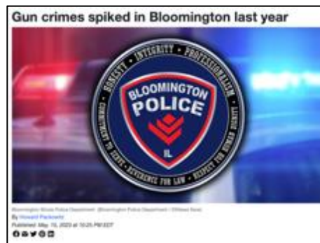
(Howard PACkowitz, “Gun crimes spiked in Bloomington last year,” News 25 Now , 5/15/23)

Headline: “Gun Crimes Spiked In Bloomington Last Year” (Howard Packowitz, “Gun Crimes Spiked In Bloomington Last Year,” News 25 Now , 5/15/23)